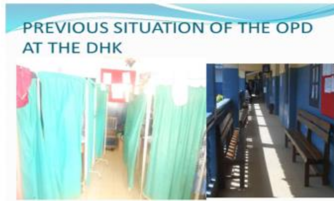
Figure 5. Previous situation of the OPD at the DHK