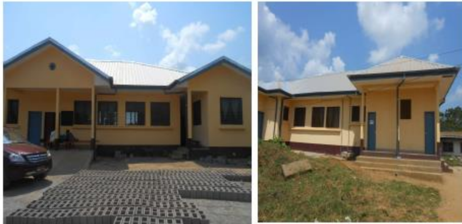
Figure 3. CMA after construction of the wards

Due to the construction of this new building, the maternity has moved to the new site providing much space for the old building for hospitalization and other activities.