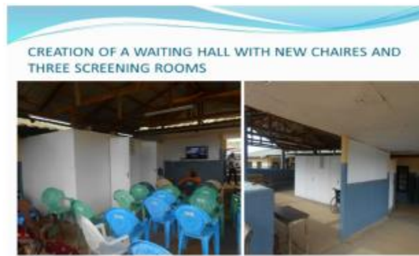
Figure 6. Current situation

The Out Patient Department (OPD) situation at the District Hospital Kumba (DHK) look like this before the implementation of PBF, which posed a problem in terms of delivery of health care and comfort of the patients.