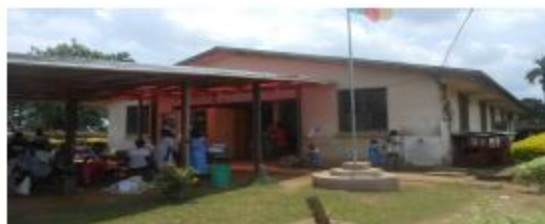
Figure 2. CMA with one ward

Before, there was only one building for the CMA (Sub Divisional Medical Health Center). This made activities very difficult because the wards were very small and not many to accommodate the population using this health facility. Men and women sleep in the same ward together with children.