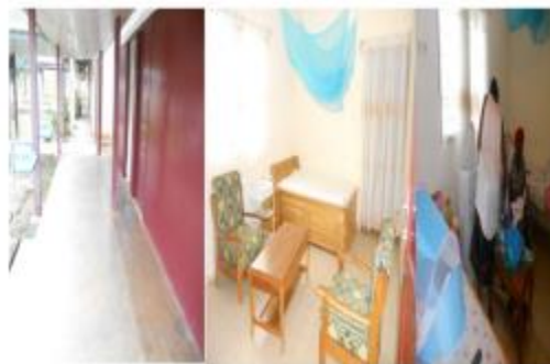
Figure 4. District hospital kumba

From Fig 3 it is clear that, PBF has been instrumental to the construction of the new building providing the initiative and necessary finances to achieve the results. This health facility had the capacity to provide better health care to the population but just needed innovation and finances to achieve high levels.